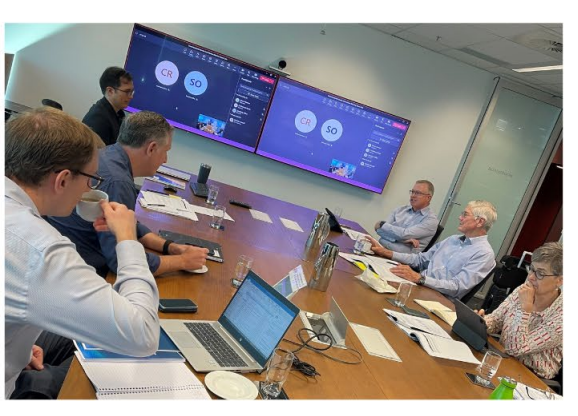
The Commission and Secretary, along with Commission staff (online) meet with officials during the state visit to the Northern Territory as part of the 2025 Review