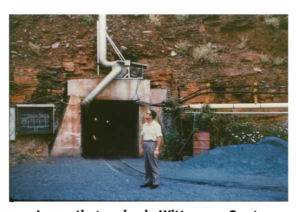
Inspecting a mine in Wittenoom Gorge, Pilbara, WA (June 1963)