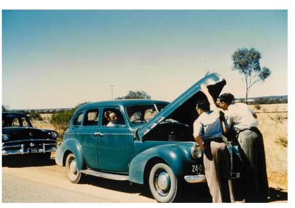
'Is she boiling?' Car breaks down near Morawa, WA during a state visit (1953)